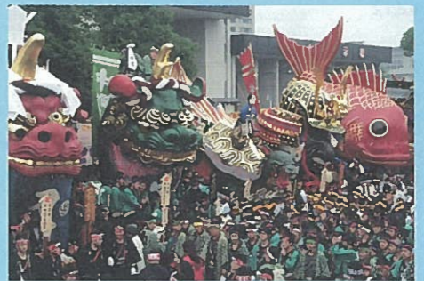
Hikiyama Float Exhibition Hall (曳山展示場) TEL 0955-73-4361 Fourteen festival floats, playing the main role of the Karatsu Kunichi festival, are exhibited here. Covered in Japanese paper, lacquered to harden, and plated with gold leaf, these floats are absolutely gorgeous. Over half of them were built in the Edo era.