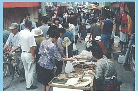
Yobuko Morning Market (呼子朝市) TEL 0955-82-3426 It is open from 7:30 am till 12:00 pm. Fresh, original and cheap seafood from Yobuko is sold here.