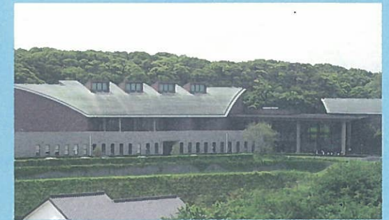
Nagoya Castle Museum (名護屋城博物館) TEL 0955-82-4905 It is located inside the remains of Nagoya Castle and exhibits materials of the history of cultural exchange between the Asian continent and Japan from ancient to contemporary times.