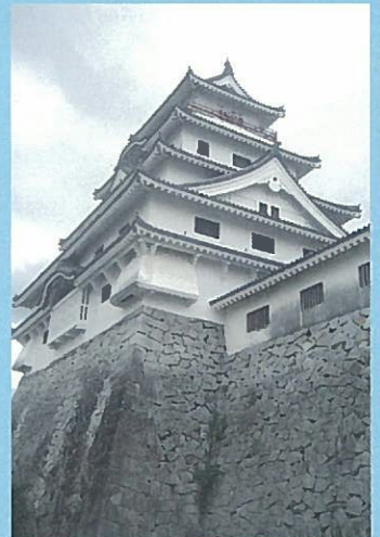
Karatsu Castle (唐津城) TEL 0955-72-5697