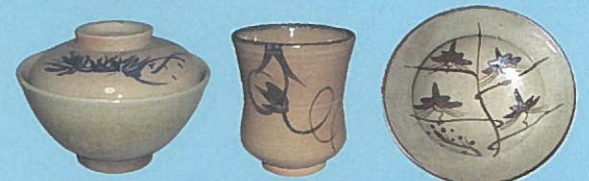
Karatsu Ware (唐津焼) Karatsu Ware, bringing out the coarse texture of local clay, is a warm and earthy pottery with its pleasant color and designs. Karatsu Ware is also one of the three most famous Japanese tea utensils that have been cherished by tea ceremony masters since the 16th century. The more the pottery is used, the more it takes on the different characteristics of its users.